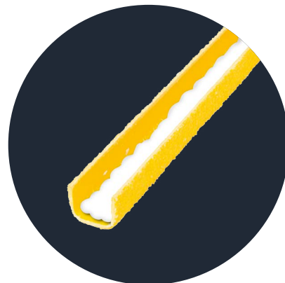
FRP Square Rung Cover