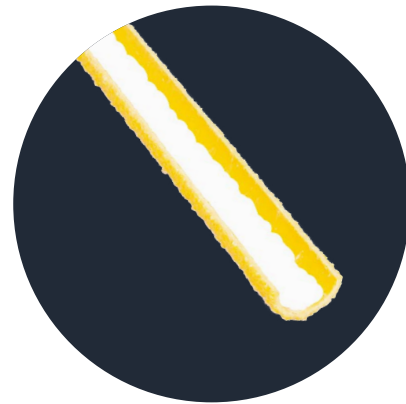
FRP Half Round Rung Cover